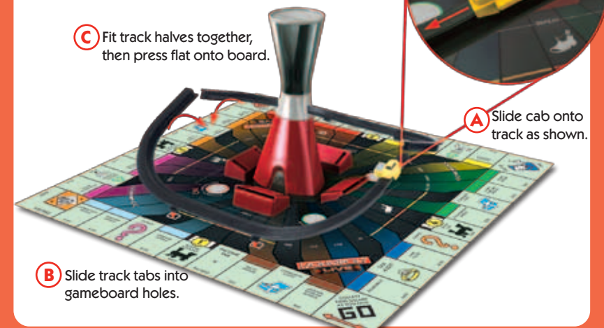
C Fit track halves together, then press flat onto board.