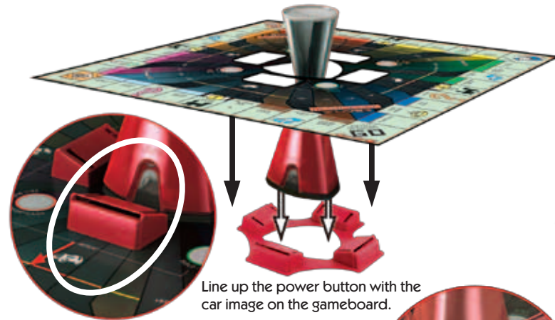
Line up the power button with the car image on the gameboard.